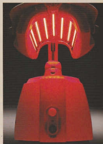
High-power LED device.